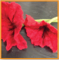
Stacy Drenckhahn Fiber Art, Specialty Yarn, Local Art beelighted.com

Site 5 Historic State Theatre 96 E 4th St