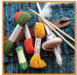
Zumbro River Fiber Arts Guild Member Displays and Demos zumbroriverfiberartsguild.com