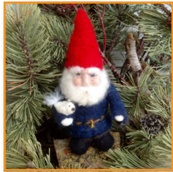
Stacy Drenckhahn Fiber art sculpture

268 So. Main St beelighted.com Enter from the back of the building (parking lot beside bank) Look for signs and large gnome.