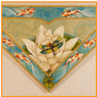
Cathy White Watercolor