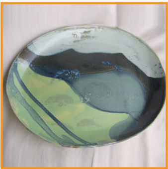
Clay Studio Members & Classes