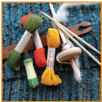
Zumbro River Fiber Arts Guild Member displays and demos zumbroriverfiberartsguild.com